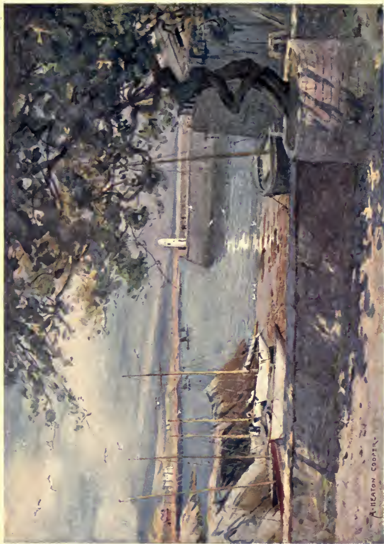
FORT ST. MARY is a pleasant little watering place on Poyllvash Bay.